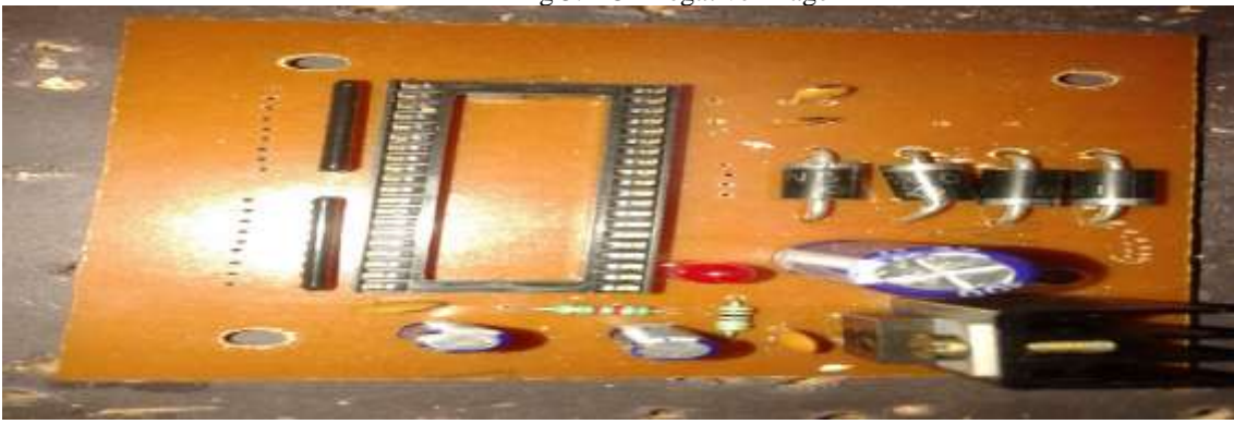
Fig 4: Top layer of PCB assembly