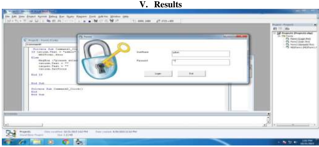
Fig 2: Snapshot of software

Using this notice board, paper work will be decreased and its time consuming technique. Message will be secured. This system is used in the Schools, colleges and various places such as industries, stations to display any kind of notices or messages. This system also can be used for advertisement. "RF based wireless notice board using microcontroller" we designed this notice board is working properly for college purpose. We got a lot of experience with the electronic components and we learned the PCB designing and software tips.